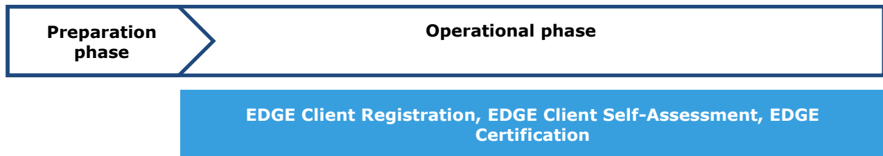
Figure 1 Components of the Certification Protocol

This document, the Chapter 5 EDGE Certification Protocol , is designed to set out the process which must be followed in order for an EDGE Certificate to be issued. It sets out the roles and responsibilities for the EDGE Client with respect to initial registration, self-assessment and selecting an EDGE Auditor; the roles and responsibilities of the EDGE Auditors in undertaking a Design Audit and a Site Audit; and finally the roles and responsibilities of the EO&M Team in reviewing and approving the EDGE Auditor's Recommendations in order to issue either a Preliminary (design stage) Certificate or a final EDGE (post construction stage) Certificate. For questions regarding the use of the EDGE logo and brand please refer to the two documents: "EDGE Branding and Media Guidelines"; and " EDGE Brand Assets Document ".