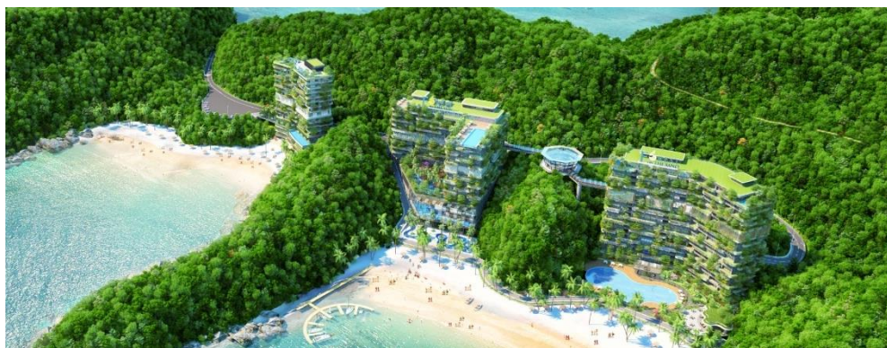
Figure 3: A rendered view of a sample resort with multiple buildings of similar height in Viet Nam.

The resorts typology typically involves merging multiple buildings into one subproject , compliance with Part 1 – Building Certification Guidance, Non-Typical EDGE Projects, Grouping Multiple Buildings into One Subproject is required in such cases.