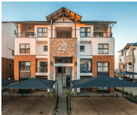
Figure 2: A sample apartment building with shared corridors located in South Africa.

For developer provision of installations in partially finished apartments, refer to Part 1 – Building Certification Guidance, Annex 3 .