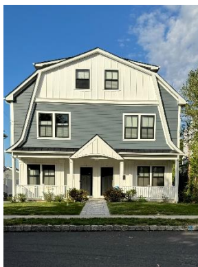
Figure 1: Semidetached homes shall be modeled as homes.

Typically used for a single building for one family unit. Examples include single-family homes or villas. Semi-detached (see Figure 1) and townhouses may also be considered under the Homes typology. They may be single unit buildings , or multiple units that are part of a development. The homes typology certification considers all amenities dedicated to the home unit; i.e. common amenities are not included. Homes typology will have one EDGE certificate issued per unit.