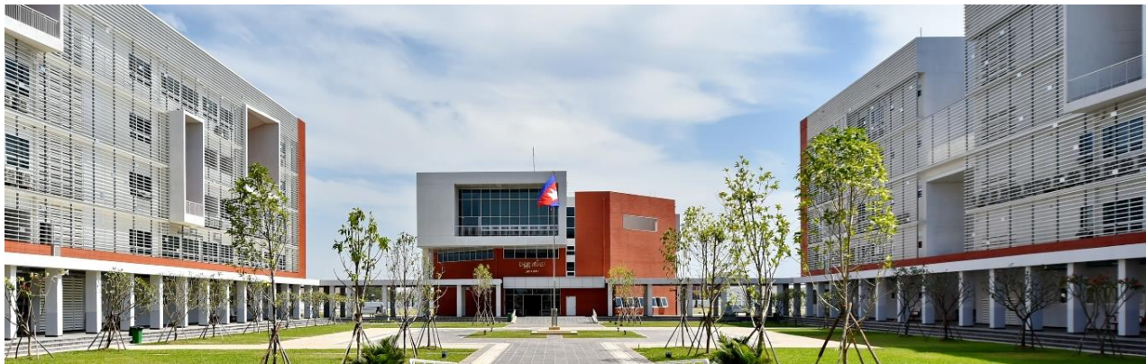
Figure 5: Multiple buildings in campus type of projects may be combined into one subproject if they meet the grouping conditions.

Typically refers to buildings used for educational purposes. Buildings such as museums may be modeled under the education typology. For campus-type buildings under the same subproject , compliance with Part 1 – Building Certification Guidance, Non-Typical EDGE Projects, Grouping Multiple Buildings into One Subproject is required.